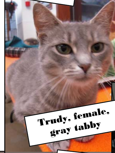
Trudy, female, gray tabby