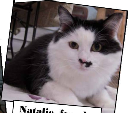
Natalie, female, black & white