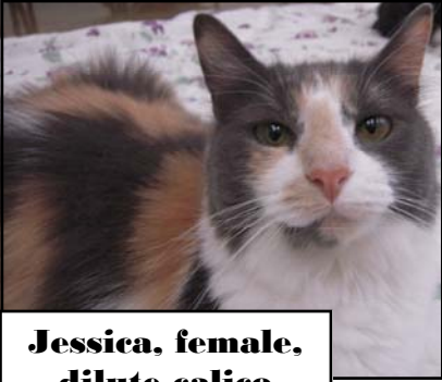
Jessica, female, dilute calico