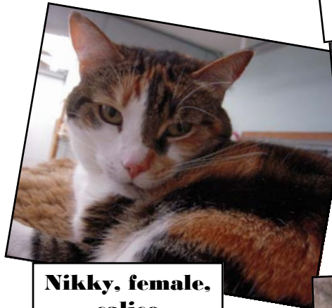
Nikky, female, calico

On the next few pages, you will get to meet some of our terrific adult cats here at the shelter. Please consider one of these wonderful, loving cats as a forever addition to your family! All it takes is a phone call to the shelter to schedule a time and date to visit. Come see for yourself all of the great qualities these special animals have to offer!