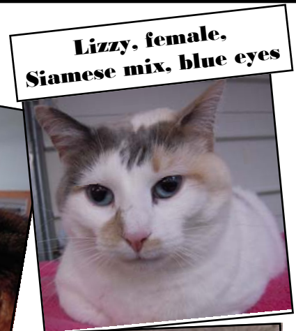
Lizzy, female, Siamese mix, blue eyes