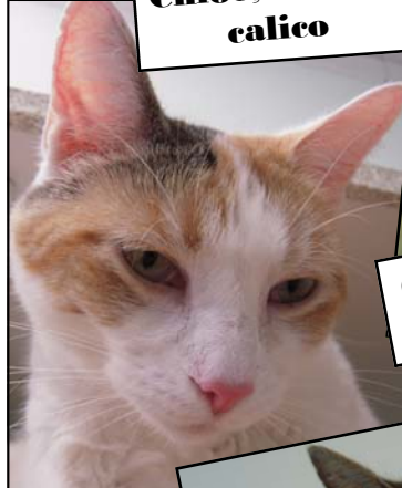
Gidget, female, calico