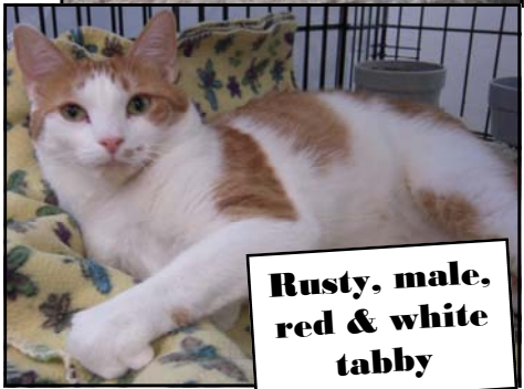
Rusty, male, red & white tabby

MARK YOUR CALENDARS We'll be at White House Fruit Farm September 17th and 18th for their annual Craft Show and Harvest Festival. Stop by our booth and see us!