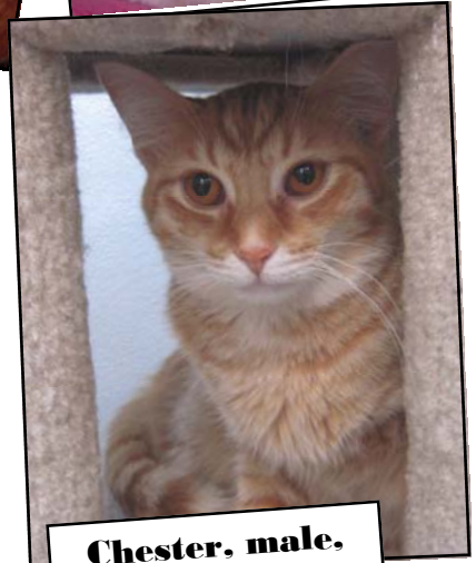
Chester, male, red tabby