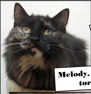
Melody, female, tortie