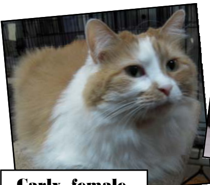
Carly, female, orange & white